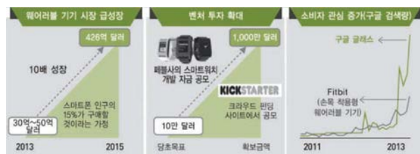
Fig. 2. Smart Wearable Product Market